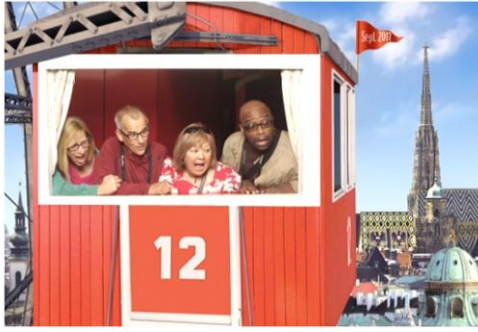
Here is our team, out having fun overlooking the city in the Prater's Wheel.