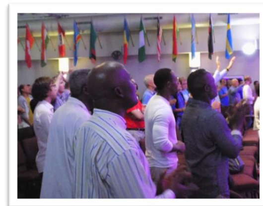
VCC's 1 st Men's Worship Night